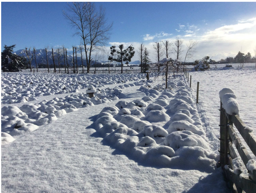
Couldn't resist this last winter photo from Leonie and Trevor Rouse.