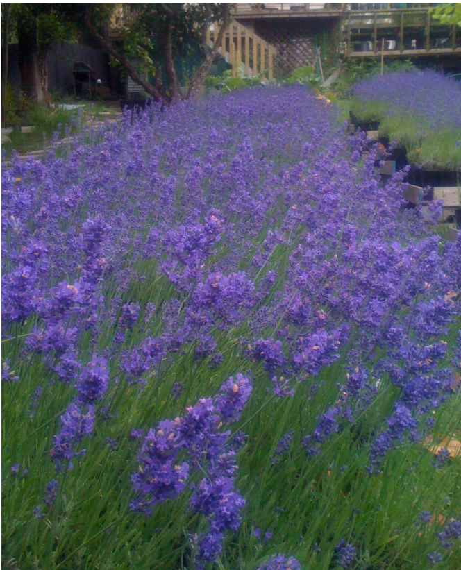
Spring/Summer 2014 Grey Lynn