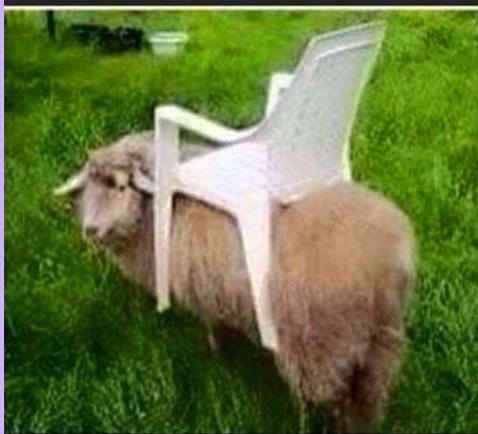
Ride on lawn mower for sale...