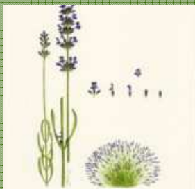
L. angustifolia 'Pacific Blue'