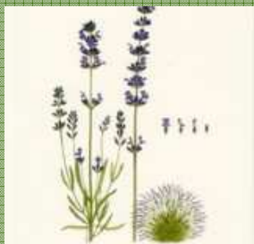
L. angustifolia 'Avice Hill'