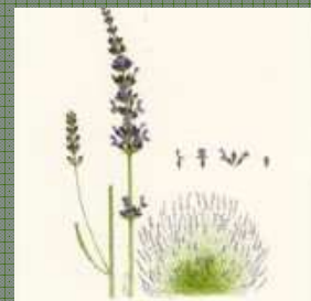
Lavandular x intermedia 'Super'