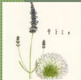
Lavandular x intermedia 'Grosso'