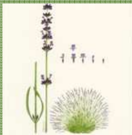
L. angustifolia 'Violet Intrigue'