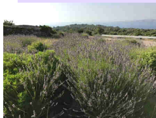
Wild lavender on the island of Hvar