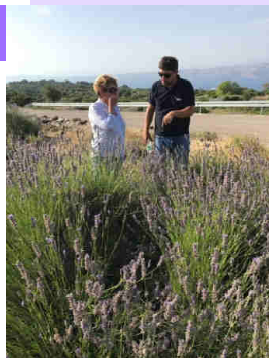
Smelling lavender with tour guide