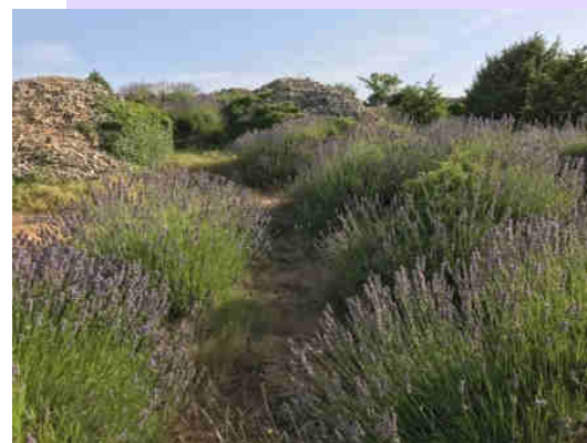
Stone houses to sleep in overnight among the lavender