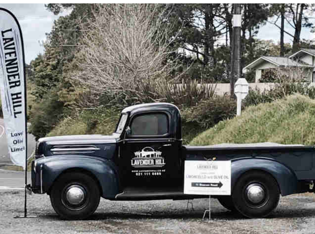
Lavender Hill's 1947 flathead V8 truck