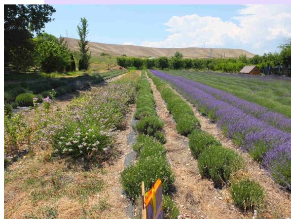
Lavender farm in Palisade