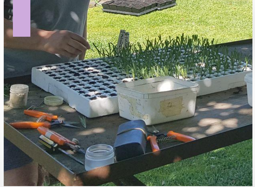
Coir plugs in jiffy tray